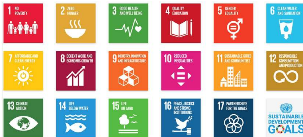
Figure 2: The United Nations Sustainable Development Goals. Source: https://www.undp.org/content/undp/en/home/sustainable-development-goals.html .

Epidemic and pandemic threats are now a global reality. Since the mid-twentieth century, new and often deadly viruses have emerged, mostly spilling over from animal reservoirs into humans. There are an estimated 500,000 animal viruses about which we know very little 41 . Understanding these threats would be a key to developing mitigation strategies to prevent the emergence of new human diseases. As outlined in this review, technology will play an important role in these efforts. But technology can only provide the most sensitive and efficient tools. Equally important is a public health infrastructure that follows good old epidemiology to track diseases before they emerge. International cooperation would also be needed because in a highly connected world a new disease emerging anywhere is a threat everywhere.